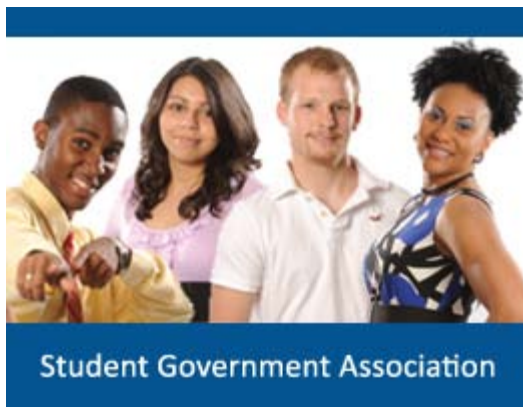
Student Government Association