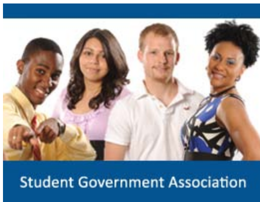
Student Government Association